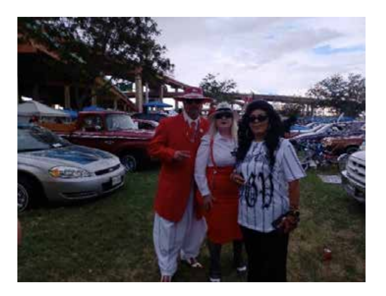
Figure 3. Pachucos and cholos.

The Chicano community recognizes three identity archetypes: the pachucos, the cholos, and the lowriders. The pachucos were on the border of Ciudad Juárez, Chihuahua, and in El Paso, Texas, and they modified the cars in an artisanal way by placing sandbags to lower them, this as a form of group identity. Later, already as migrants around the Second World War, the transformation was carried out by implementing hydraulic technology to "knock them down".