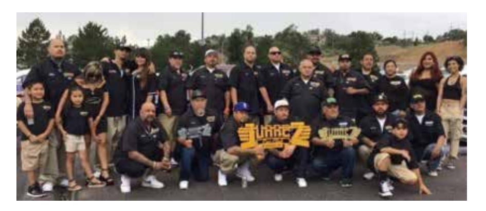
Figure 7. Juárez Car Club, chapter Kansas City.

But in addition to the men's and women's groups, there are mixed lowrider clubs, such as the Juárez Car Club, originally from Ciudad Juárez, Chihuahua, which has chapters in different cities, such as Kansas City. These are concessions with new members and their vehicles (see figure 7).