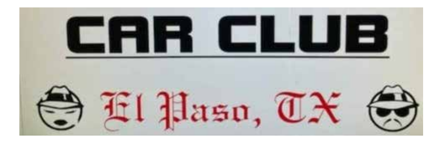
Figure 4. Mixed car Club.

both archetypes: the cholo and the pachuco (see figure 4). It stands out that the mixed clubs include both logos on their blanket.