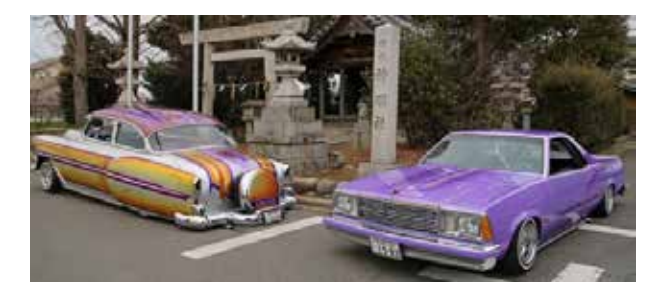
Figure 1. Lowriders in Japan.

The cars that fall within this tradition are from the year 1990 to previous decades, especially from the Chevrolet brand, with the Impala model as one of the favorites. Since the first artisan modifications, in an activity known as "knocking down" the car, groups such as the "pachucos" have been involved in the exercise of this rolling tradition. Subsequently, in the context of civil rights, it was attributed to a group of young Chicano transgressors called "cholos", who made the taste for these cars cross-border (see figure 1).