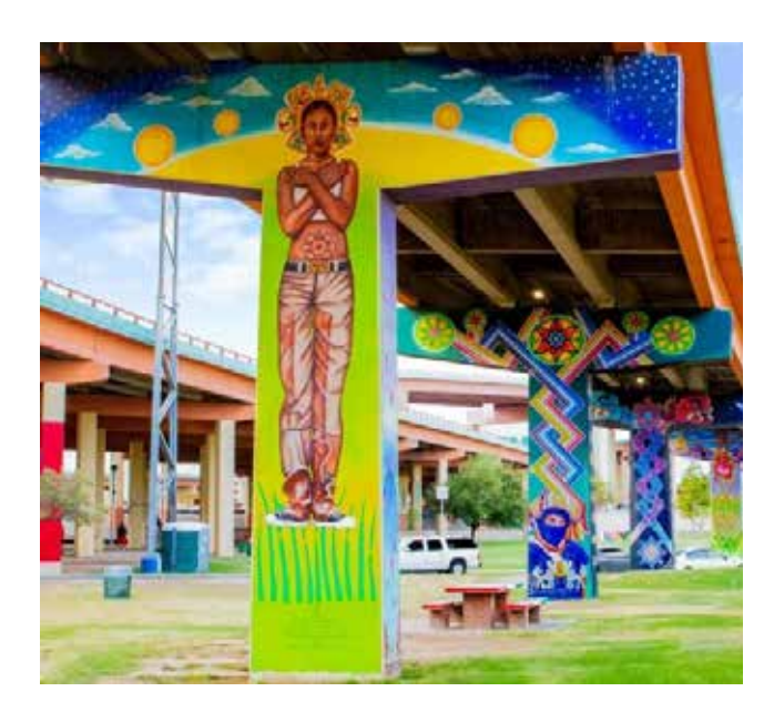
Figure 12. Murals on columns in Lincoln park, El Paso city.

In a festive atmosphere, the park fills with attendees who are sympathetic to the lowrider lifestyle. The exhibition of low & slow cars, bicycles, motorcycles and various objects is found along the corridors where there are also vendors' tents with various products ranging from "fedoras" (the typical pachuco or cholo hat) to t-shirts, accessories and ethnic jewelry, quartz stones, spare parts for this type of vehicle, nostalgic and collectible dolls, posters and records with oldies songs (specifically from the fifties and sixties). Del Monte Madrigal (2014) refers to nostalgia in lowrider cars as a memory car because: "it is linked to nostalgia [...] it is the motive that guides the senses [...] which it finds [...] in memory mobility. When they take their vintage cars out onto the streets, they 'evoke' a past that they honor and do justice by bringing it to the present" (p. 123).