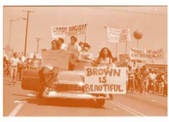
Figure 8. La Adelita and the protest.