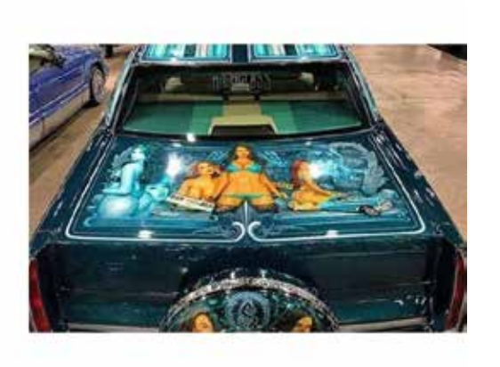
Figures 9 and 10. Cover 1979 and mural in a low & slow.

The lowrider is considered a family activity, in which women are empowered by being an important pillar in many areas and by having the resources to acquire and transform a vehicle they own. In this regard, the lowrider activist from the Chicano Museum in San Diego, California, mentions the valuable work of women: "since the seventies in San Diego, women have participated in clubs. The role of women has changed over time, it is very important to give them credit [...] since their participation is important [...] women are imposing their own identity" (R. Reyes, personal communication, September 18th, 2022).