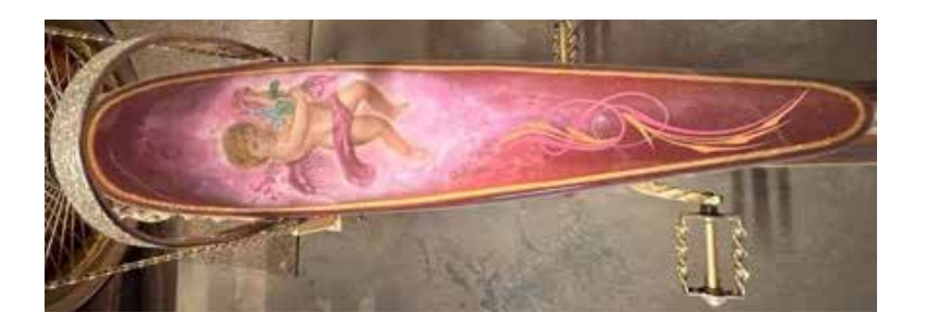
Figure 5. The Guardian Angel. Religious detail on the seat of a bicycle owned by a teenager, dedicated in honor of his cancer-surviving aunt.

The lowrider aesthetic and visual manifestation is represented above all in a modified car especially in public spaces. The visual and identity elements are reflected as murals on the vehicles through religious (see figure 5), patriotic and pre-Hispanic iconographies, among many others. "It was also common to see [...] driving their low rider "ranflas" (cars modified to lower them as much as possible to the level of the pavement), adoring the "jefita" (Virgin of Guadalupe) or the crucified Christ or in full Calvary" (Monárrez, 2017, p.87).