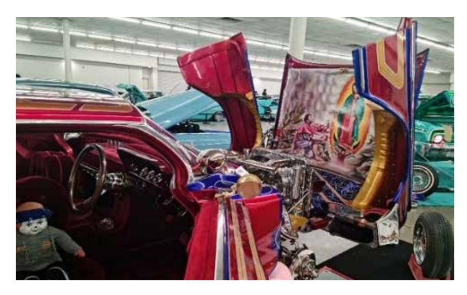
Figure 27. Detail in tapestry and mural.