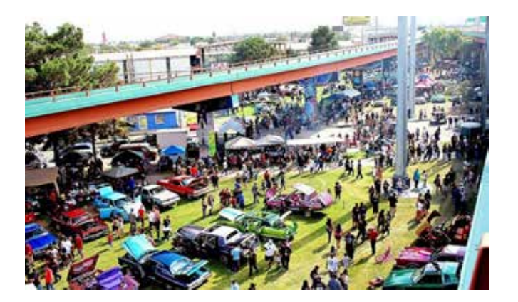
Figure 2. "Lincoln park day" celebration, September 18, 2022.

For some, these objects are considered as "canvas" or art canvases, or as "rasquache art", as indicated by Ybarra-Frausto (1989). For those who consider themselves lowriders, this activity is a tradition in which they can pour out their philosophy, culture, specific tastes, as well as their personal testimonials. The lowrider is considered a lifestyle, which is celebrated through exhibitions/exhibitions, walks/cruising and parades/parades (see figure 2).